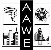
American Association for Wind Engineering