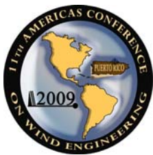
Americas Conference on Wind Engineering to be held in Beautiful Puerto Rico.