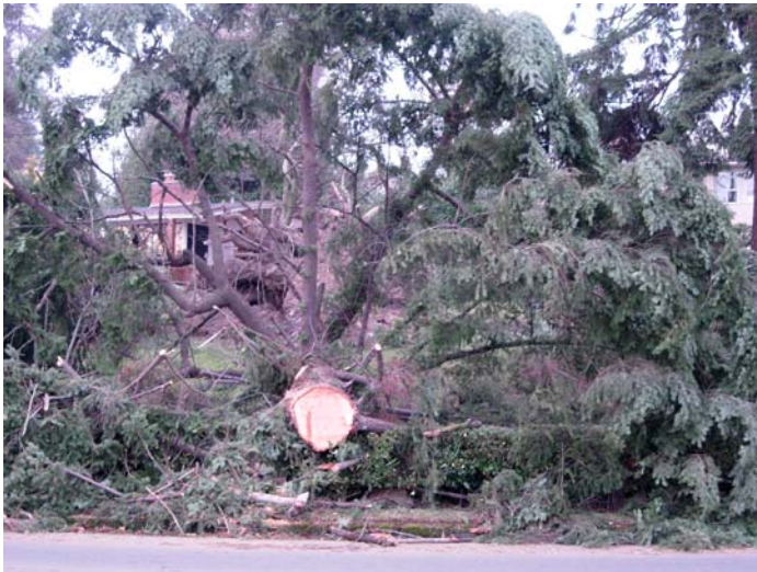
Figure 1. Tree has fallen over both house in background and roadway in foreground. City workers have just used chainsaws to remove a section of the trunk in the foreground.

Power outages were extensive. Figure 2 shows a plot of customer outages for December 2006 for Puget Sound Energy. Over 700,000 customers lost power in the storm; 159 substations were out and 85 transmission lines were out. Because the storm occurred during the holiday season, affected residents were particularly unhappy. Service teams faced challenges in the restoration of power delivery systems because many streets were blocked by trees and storm debris. A restoration model of the form