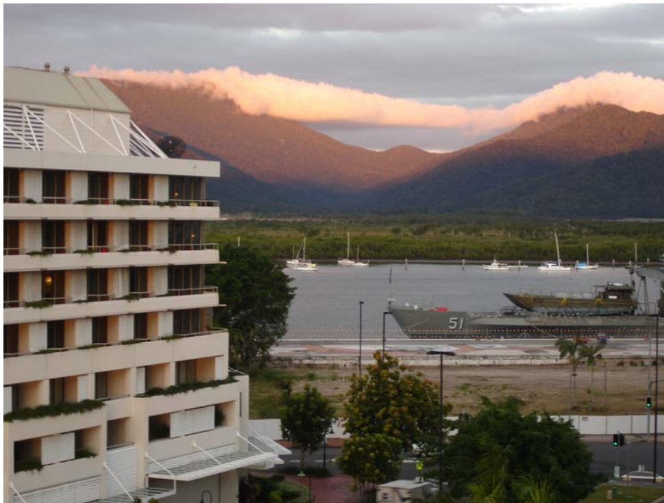
The ICWE-12 was held in Cairns, Queensland, Australia, earlier this month.