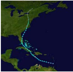
Hurricane Ernesto was a category 1 hurricane that caused 14 fatalities. Find out about the other hurricane's and typhoon's on page 7.