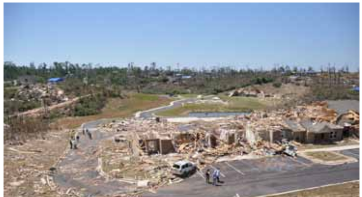
Figure 4: General view of a new housing complex.