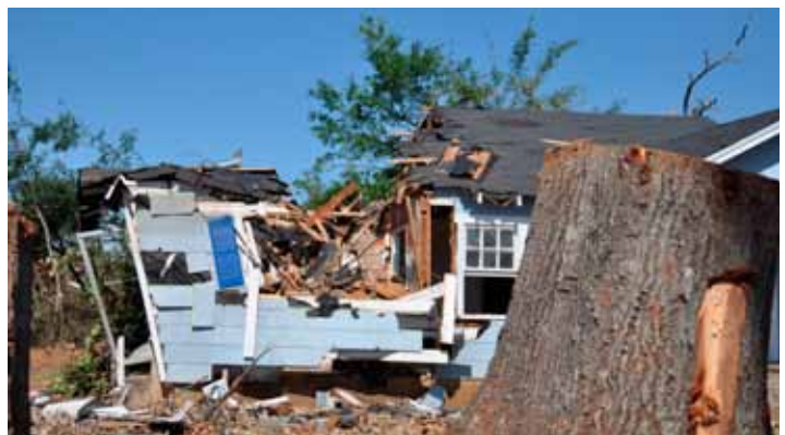
Figure 2: Tree fall caused severe building damage.