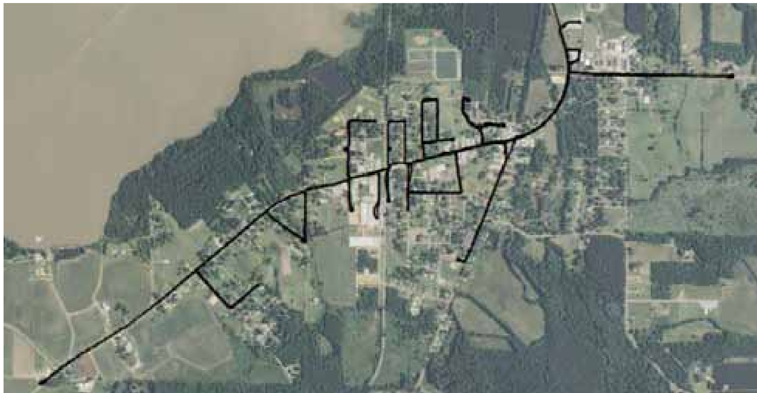
Figure 5: GIS trail of VIEWS data, Smithville, MS