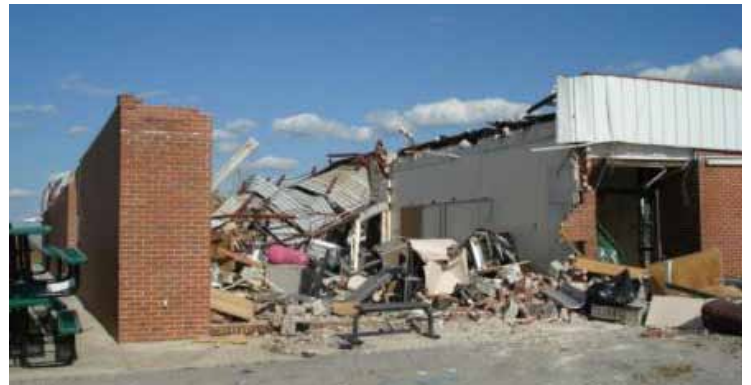
Figure 4: School Buildings, Hackleburg, AL