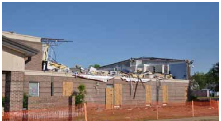
Figure 3: Most of the second floor of one wing collapsed at this 14-year-old school. It had a steel frame with CMU/brick veneer exterior walls.