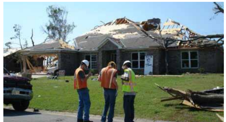
Figure 1: LSU PhD students assessing tornado-damaged residences, Tuscaloosa, AL

The deployment plan included three main locations: Tuscaloosa, AL, Hackleburg, AL, and Smithville, MS. The team completed assessments on May 6 th in Tuscaloosa and Hackleburg. On May 7 th , further assessments were completed in Hackleburg and Smithville. In Tuscaloosa, the team focused on hands-on training of students regarding damage assessment techniques, including compiling data on survey damage forms and classifying tornado damage using procedures outlined in the Enhanced Fujita Scale. In Hackleburg and Smithville, the team assessed critical community structures and captured geo-referenced video of both towns. Damage Indicators (DIs) and Degrees of Damage (DODs) for over 15 structures were completed during the deployment.