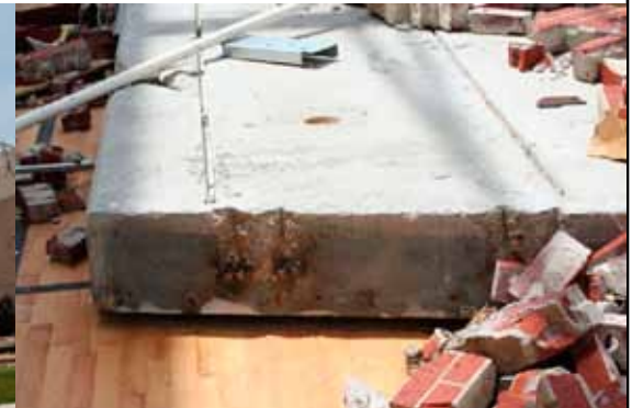
Figure 2: Puddle welded connection on top of wall failed

A team, consisting of university engineers and scientists as well as industry professionals, surveyed the structural damage caused by both the April 27th tornado which ripped through the city of Tuscaloosa, AL, and then the May 22nd tornado which devastated Joplin, MO. The tornadoes cut approximately a ½ - 1 mile wide swath through the centers of both Tuscaloosa and Joplin. Much of the residential construction consisted mainly of older 1930s to 1970s buildings and light commercial structures, with some newer multi-family structures scattered throughout. These were powerful tornadoes that the National Weather Service (NWS) rated as an EF4 in Tuscaloosa and an EF5 in Joplin. Approximately 5000 buildings were lost and 500 businesses were lost or directly affected by the tornado in Tuscaloosa. In Joplin, over 8000 buildings were destroyed or damaged and over 150 people lost their lives. Over a period of 1.5 weeks at the two locations the team looked at hundreds of homes and other structures. Preliminary observations of the structural damage and some generalized mitigation approaches to save lives and reduce losses are discussed below.