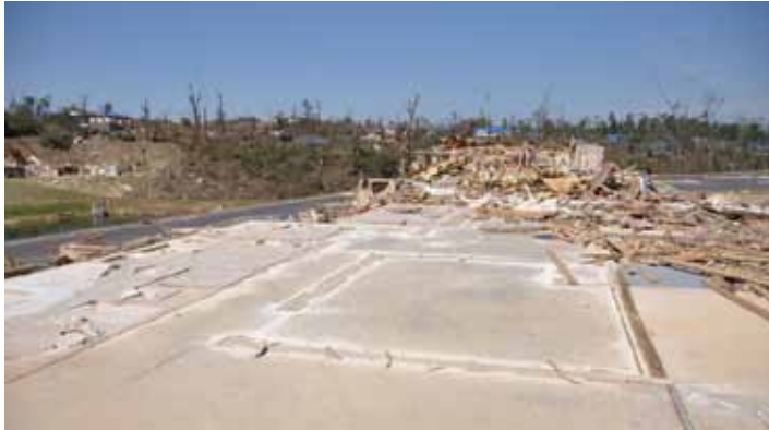
Figure 5: At this unit all of the walls were blown away.