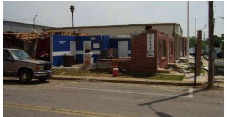
Figure 3: Police Station, Hackleburg, AL