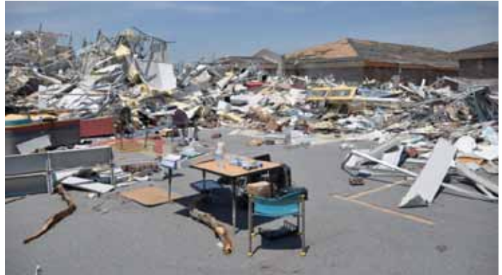
Figure 1: This ten year old one story school had three classroom wings and a central core area. One classroom wing and most of the central core collapsed. This is a view of the central core area.

The MAT is preparing a comprehensive report that will be available around the end of the year.