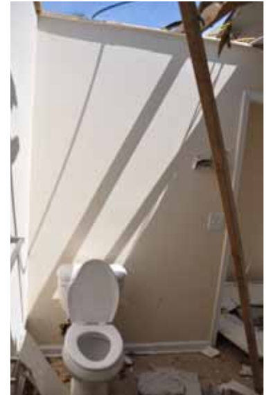
Figure 6: The roof structure blew away at this unit. Interior bathrooms such as this one often provide safe refuge during weak or strong tornadoes. However, a 2x4 and other wind-borne debris entered this bathroom. This illustrates the importance of having a safe room as recommended in FEMA 320. http://www.fema.gov/library/viewRecord.do?id=1536