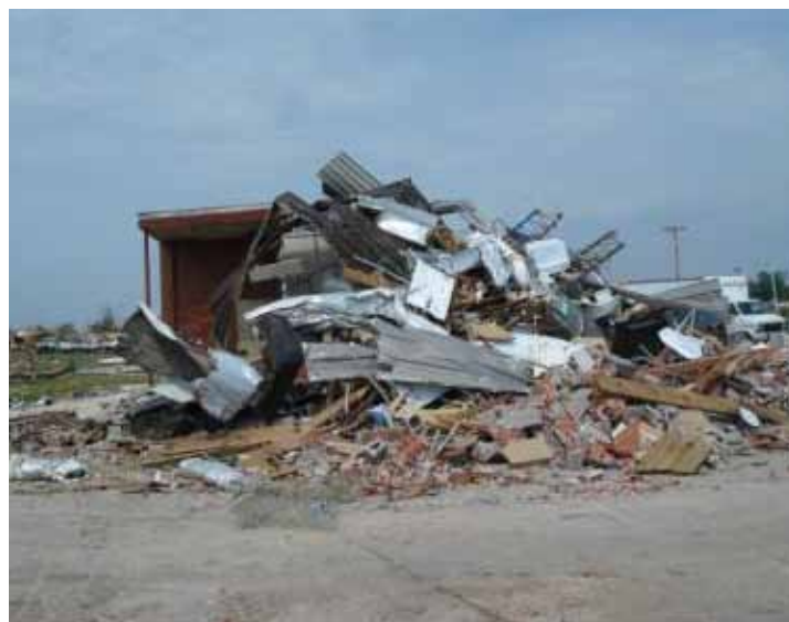
Figure 6: Post Office, Smithville, MS

Analysis of geo-referenced video collected using the VIEWSTM System is currently in progress. Completion of this task should help to further confirm the EF rating of the Hackleburg and Smithville tornadoes. Additionally, the need for more efficient means to collect enriched data following such events was cited. LSU's CAPTURE Lab intends to address this need through tablet computer applications and Unmanned Aerial Vehicle (UAV) platforms. These devices offer many advantages over current data collection practices and are sure to become an integral part of future CAPTURE Lab deployments.